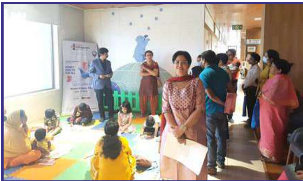
WKD Awareness Program at Bhagirathi Neotia WCCC, Kolkata