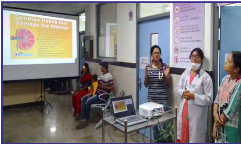
Public Lecture at AIIMS Kalyani on WKD