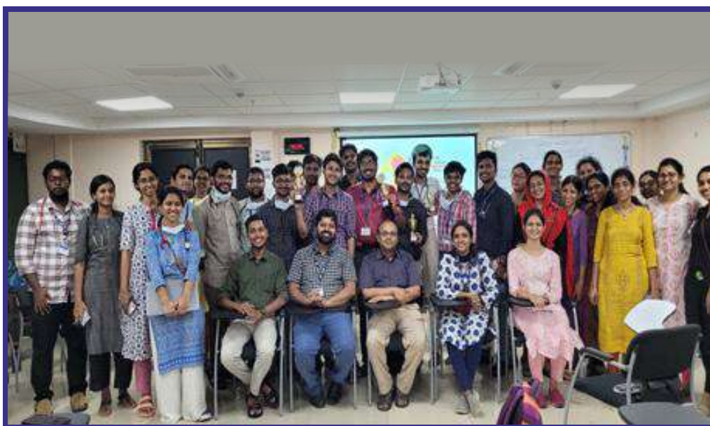
Postgraduate Quiz organised at JIPMER, Puducherry on WKD