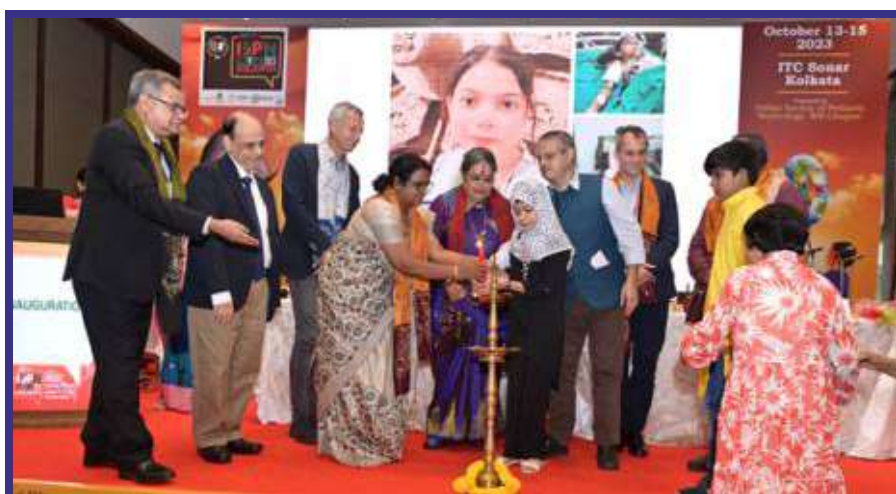
Celebrity Singer Ms Usha Uthup

Celebrity singer Ms Usha Uthup was the chief guest on the official inauguration.