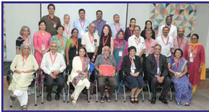
Workshop and Conference faculty at CMC, Vellore

The 2nd Pediatric Renal Transplant and Bladder workshop held from 6 th to 8 th July 2023 was supported by the International Society of Pediatric Nephrology (IPNA) and the International Society of Nephrology – The Transplantation Society (ISN-TTS), Sister Transplant Centre program and endorsed by the Indian Societies of Pediatric Nephrology (ISPN) and Nephrology (ISN). This event was conducted at CMC Vellore and more than 100 attendees registered for the event.