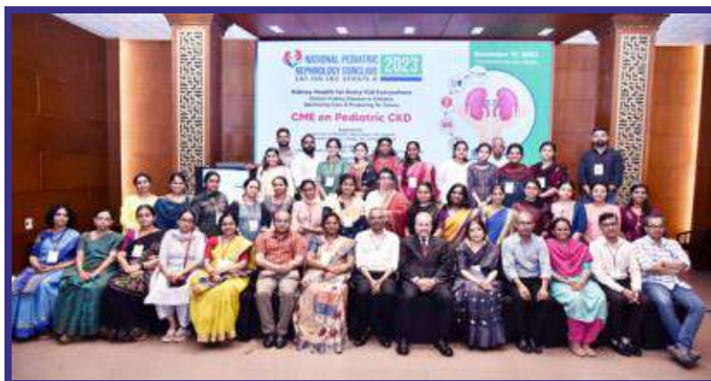
IPNA Teaching course and ISN SRC Update at Thiruvananthapuram

An IPNA Teaching course and ISN SRC update 4 was conducted on 11 th & 12 th November 2023 by the Department of Pediatric Nephrology, SAT Hospital, Govt. Medical College, Thiruvananthapuram. The theme of the conclave was 'Kidney Health for Every Kid Everywhere'. The event was attended by 80 participants.