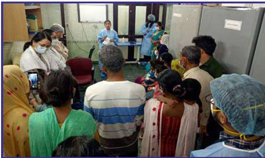
Teaching Sessions by Nursing Officers at LHMC, New Delhi