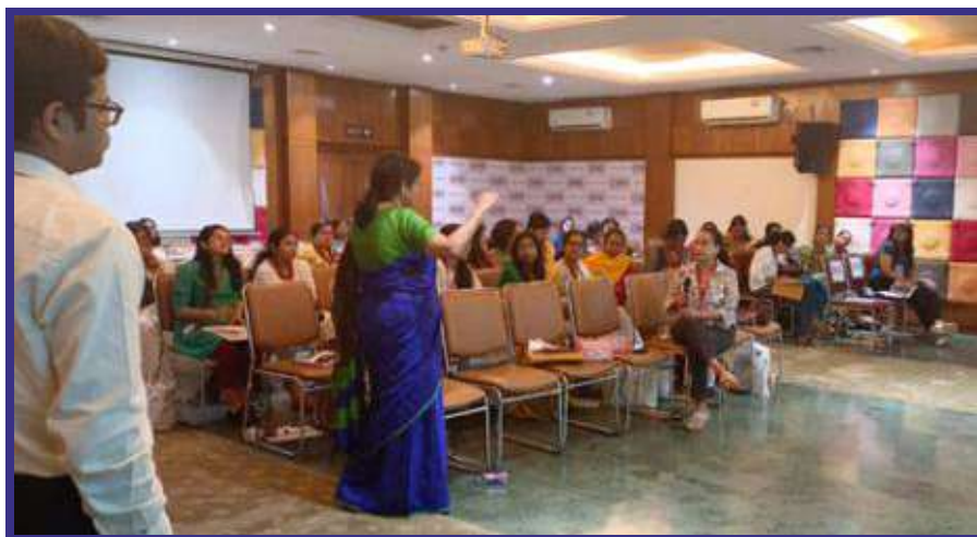
Renal Nutrition in Pediatric CKD