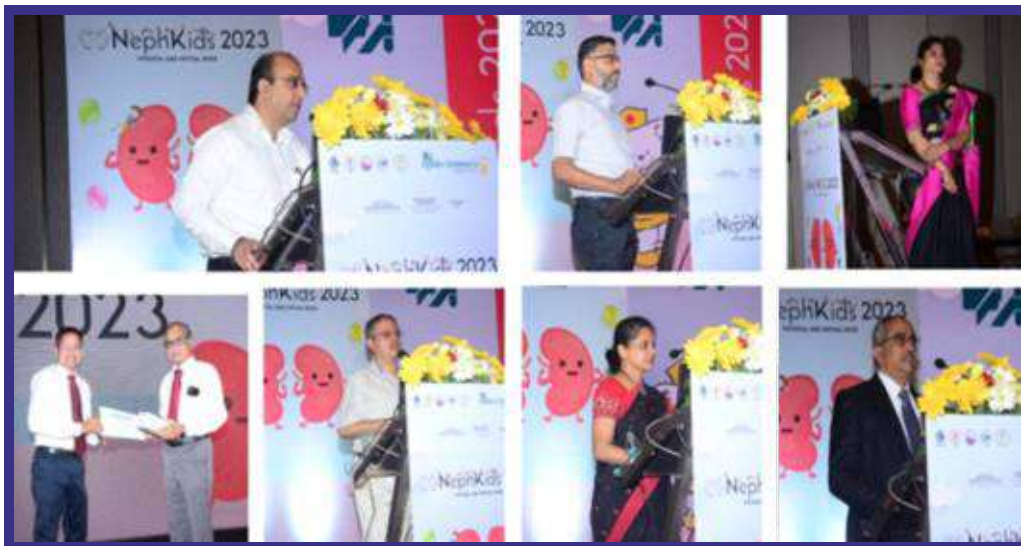
NephKids 2023 at Apollo Hospital, Chennai