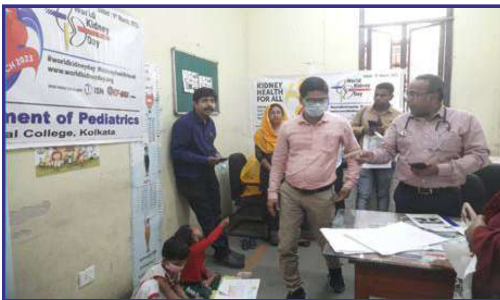
Medical College, Kolkata Public Awareness Program