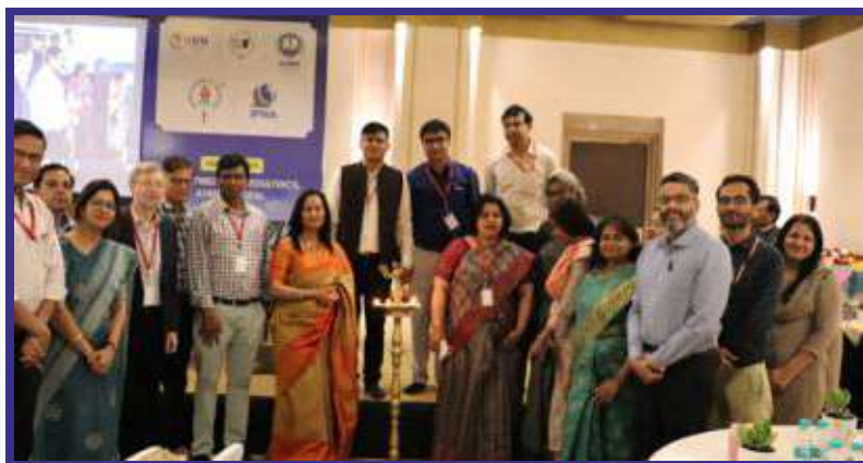
Pediatric Nephrology Conclave and Dialysis Workshop at AIIMS, Bhopal

This was hosted by AIIMS Bhopal, Department of Pediatrics, Division of Pediatric Nephrology on 10th and 11th March 2023. The event was endorsed by IPNA with 150 participants. The pre-conclave workshop with focus on diagnosis and management of AKI in children was followed by workshop on haemodialysis, peritoneal dialysis, point of care ultrasonography(POCUS) and central line/haemodialysis line insertion.