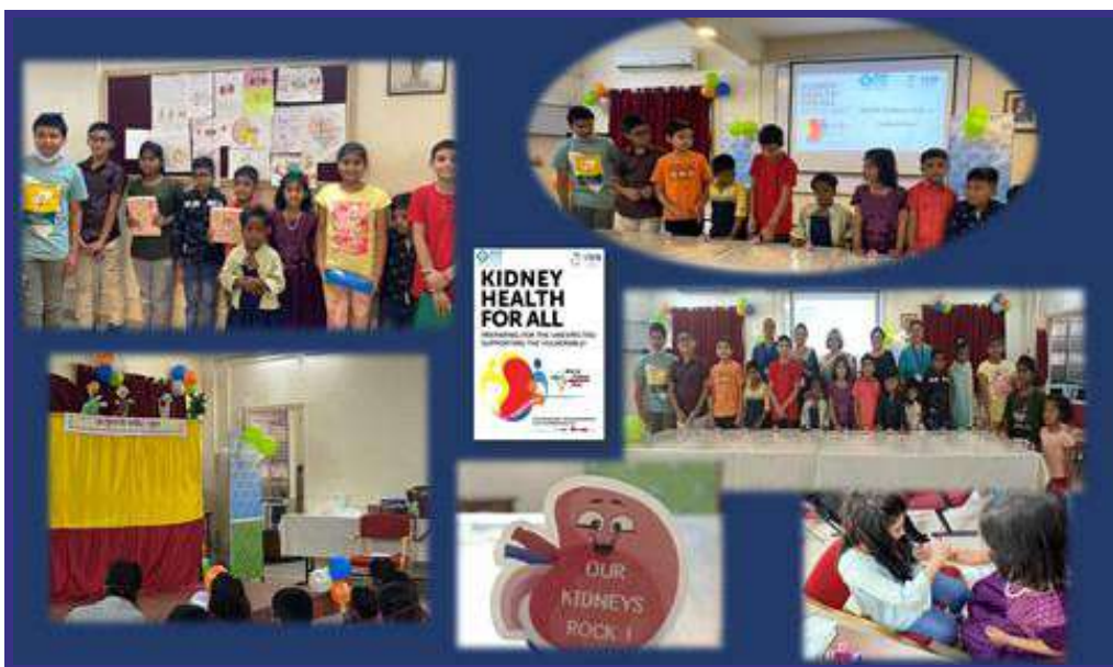
WKD Celebrations at KEM, Pune