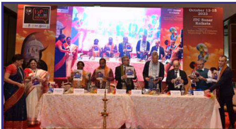
Five Presidents in Inauguration