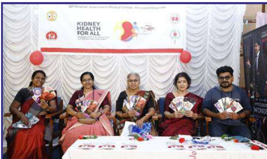
SAT Trivandrum - release of pamphlets during WKD celebrations

Theme of World Kidney Day 2023 was 'Kidney Health for all- Preparing for Unexpected, Supporting the Vulnerable'. WKD was celebrated at various centres across the country with great enthusiasm on 9th March 2023, the second Thursday of March. Here are a few glimpses of the events across some centres.