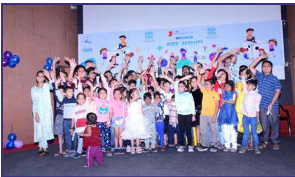
WKD at IKDRC, Ahmedabad attended by 100 participants