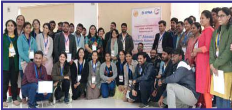
Pediatric Nephrology Meet at AIIMS, Jodhpur

This meet at AIIMS Jodhpur (28-29th January 2023) was attended by over 100 participants and 25 faculty from across the country.